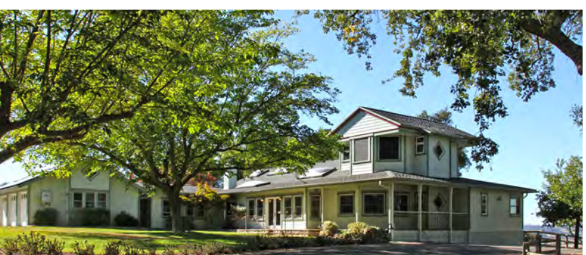
Single Family Residence, Arroyo Grande, California

A 3-story residence on a very tight urban lot in Oceano, CA