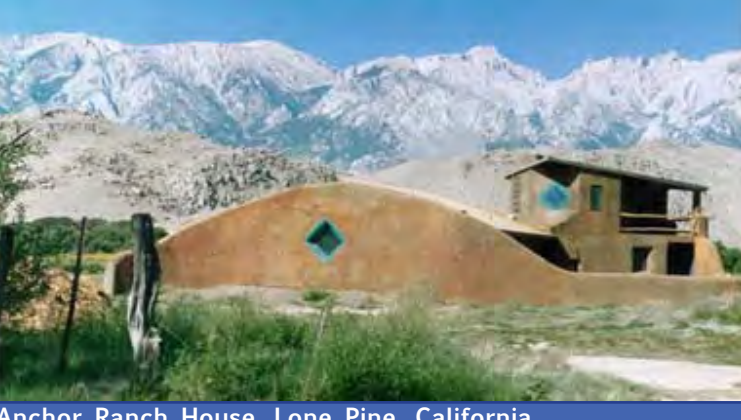
Anchor Ranch House, Lone Pine, California This was the first permitted straw bale building in California