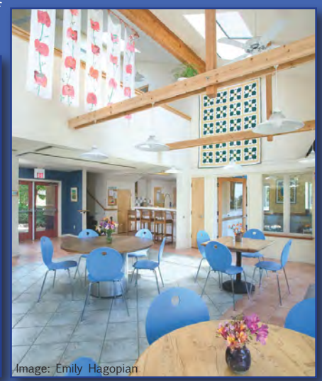
Common house interior