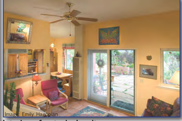
Interior of a typical unit

In cohousing, the neighborhood is formed first and physical planning and design follows. If successful, as in this case, many social and economic advantages are achieved because, to quote Cohousing Developer Jim Leach: