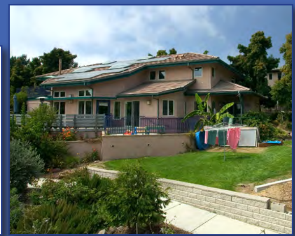
Common house exterior