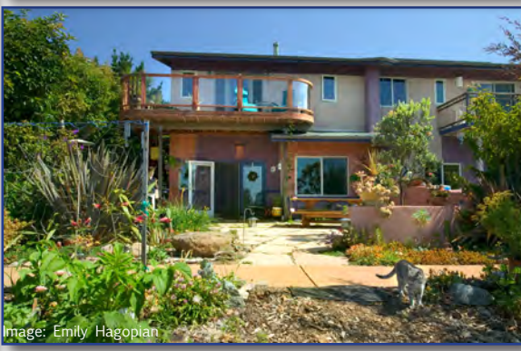
The overall site layout and the flexible building design encourages individual customization of interiors and exteriors as much as possible.